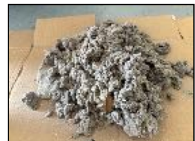
This was submitted to us by a Beecher resident who recently had their dryer vent cleaned! This pile filled over 1/2 of a GROCERY BAG!!

Don't Wait for a Fire to Take Action. Clean the Vent. Stay Safe!